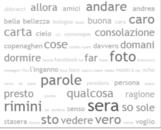
Figure 2: Word clouds of the 70 most frequent words in meeting transcriptions and Facebook data

to the experiments in Facebook discussed and planned actions ("dormire", "andare") places ("rimini", "copenhagen") and times ("sera", stasera", "domani") while in meetings they told and discussed mainly about places ("bologna", "rimini") and people ("tipo", "gente").